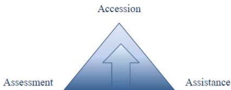
Figure 1: Accession, Assessment, Assistance

Accession is both an outcome and a process with specific steps from pre-candidacy to formal candidacy to milestones and date setting. Assistance , which refers to action, is how “Rule of Law” reform is supported from the outside through aid, diplomacy and various programmes, and is not EU specific. Between the two, assessment or the monitor of something labelled “progress” in the countries in question, constitutes both annual milestones for accession and guidelines for action, including aid. It is this dual character of assessment which complicates our task. In one sense, the concern for sustainability is shared by many in the “Rule of Law promotion” community around the world; but for the purpose at hand, we must combine the generic findings emanating from that front, with the special challenge associated with the sui generis “threshold” quality of enlargement. The questions differ: